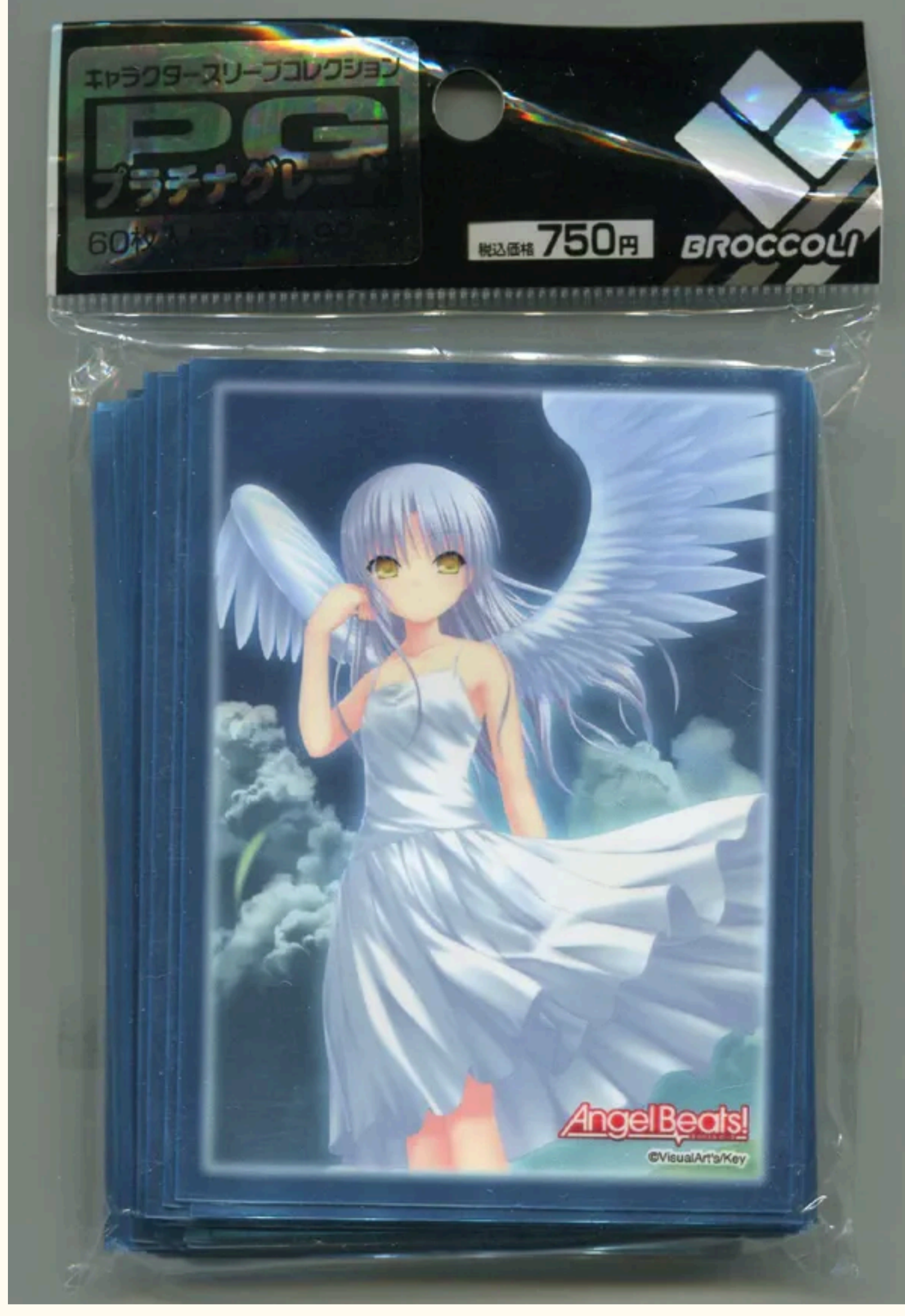
Don't you love her More knowing she was invested in, the upfront costs gathered?

You can find a place to market your dreams and loves, and its not selling out. There will always be a market somewhere made up of the people who believe in love like you. It becomes crystalized, it gets released, it gets brought, it gets kept and sold. Your Product-Arts or Art-Products can integrate into lives, be speculated upon.