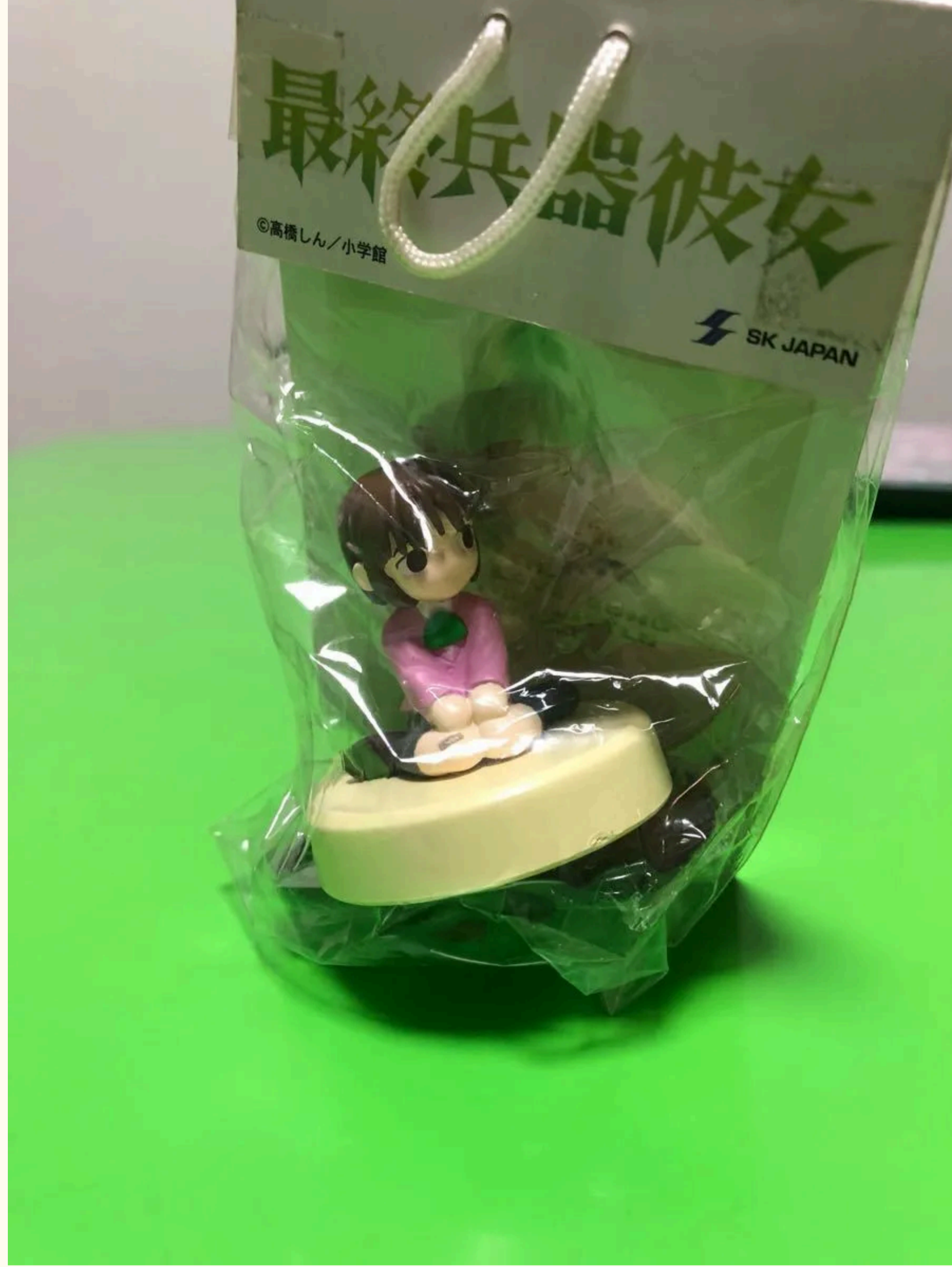
Chise from "Saikano: The Last Love Song on This Little Planet" or "She: The Ultimate Weapon"

Her Moe-elements were selected by her maker, they had to be justified to investors, the creative had to believe and make others believe. "No Sir, you don't understand, We have to keep the band-aids on her knees, she must look left. We cannot cut these corners" Its Romantic i think, you have to sell 3 love to yourself, others and to the one you love. You bring her home to meet your parents, gain their blessing. Marry.